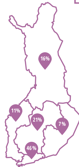
Location of the companies N:220